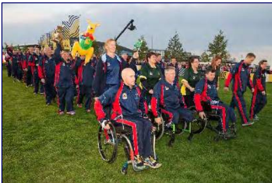
Members of the Australian Team march into Queen Elizabeth Olympic Park during the opening ceremony of the Invictus Games in London on September 10.