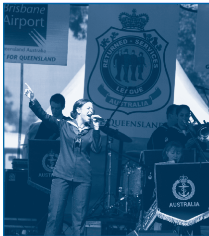
Enjoying the Navy Band at RSL Bulimba Festival 2012

of connecting with the broader community, young and old, and raising awareness of the assistance we provide to the brave men and women who have served or are currently serving.