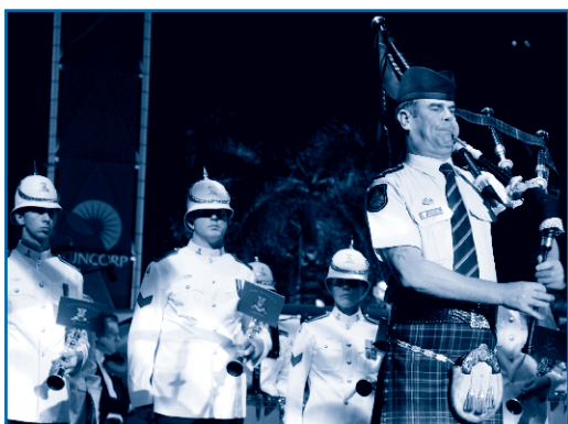
Queensland Police Pipes & Drums play for the crowd

The 2012 RSL ANZAC Appeal ran through the month of April, with the grand finalé being our annual ANZAC Eve Concert held on April 24 in partnership with the Queensland Symphony Orchestra. This appeal is just one of our major fundraising initiatives for the year. In 2012 the aim was to raise $1 for the 420,127 Queenslanders who have courageously fought for our freedom since 1915 and funds raised during the RSL ANAZC Appeal will directly assist directly assists both current and former serving members of the Australian Defence Force and their dependants.