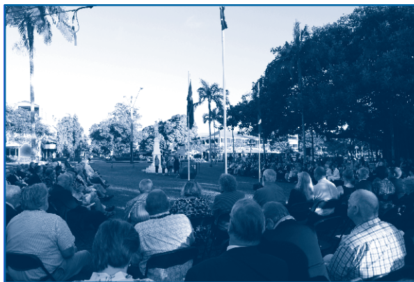
AGM Opening Ceremony, ANZAC Park, Port Douglas

being the ex-service organisation by engaging with the community and supporting those in need.