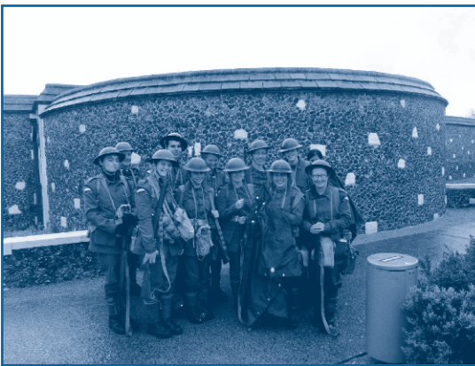
Students and teachers try on WWI uniforms at Passchendaele during their visit to the Western Front as part of the Premier's ANZAC Scholars' scheme

With the active support and participation of the NSW State Branch, the NSW Education Department awards 20 scholarships each year to students enrolled in both government and non-government schools for pilgrimages to battlefields including Gallipoli, Western Front, Korea, Vietnam and other sites in Asia. The scholarships ensure that the ANZAC story remains a living part of Australian history by encouraging the students to study military history and to return to share their knowledge and experiences with friends and families.