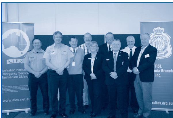
RSL Tasmania and State Emergency Services representatives

Service membership has increased marginally in 2012 and there has been a marked increase in Affiliate membership throughout the year. The Social members are continuing to be encouraged to change their membership status to Affiliate and the present indication is that Affiliate membership in Tasmania will continue to grow steadily. In October 2012 RSL Tasmania embarked on a membership drive with the State Emergency Services, including Tasmania Police, Fire and Ambulance Services and the SES. The State Emergency Services have responded very favorably. We see this as a positive step towards maintaining or increasing membership particularly in our smaller country Sub Branches.