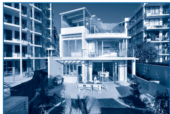
Art Union Property located at Broachbeach, Gold Coast.

Another focus area has been to ensure each of the districts and sub-branches are commercially viable now