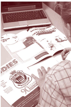
JPC Student with Studies Program

Queensland has continued to act upon our Youth Charter that calls for support in the development of the nation's youth. Support for the cadet movement and the continuing success of the RSL/ADF Cadet of the Year program has been achieved during 2006. State Council have budgeted a considerable amount of funding to establish a school-based scholarship program throughout the State, assisted by world renowned Bond University.