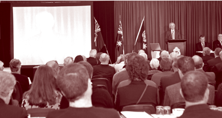
The Governor, His Excellency Professor David de Kretser addressing the State Conference