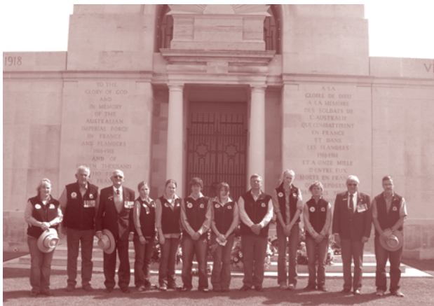
2006 Frank MacDonald MM Memorial Prize Tour Party