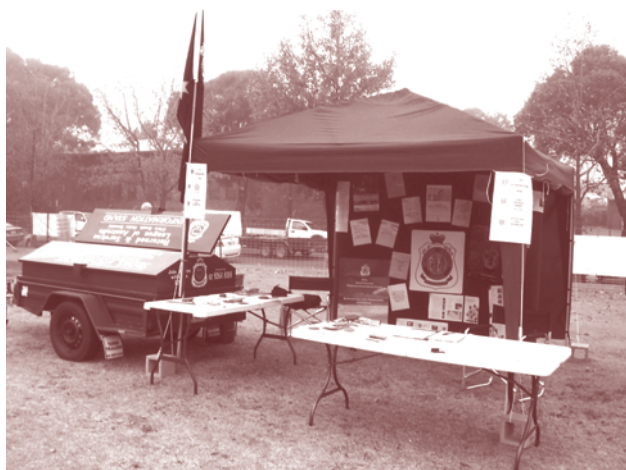
Trailer and equipment used in recruiting

It is interesting to note that membership 10 years ago stood at 91,558 and 20 years ago at 120,470.