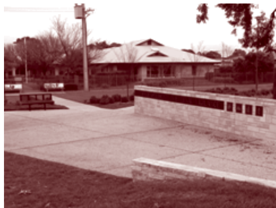
Wall of Honour in RSL Villas Community Park

The upgrading of the gardens adjacent to the property has been completed and now forms an integral part of the Villas. The residents can now commemorate Memorial Services at the Wall of Honour as well as entertain visitors, including children who will have access to a modern playground.