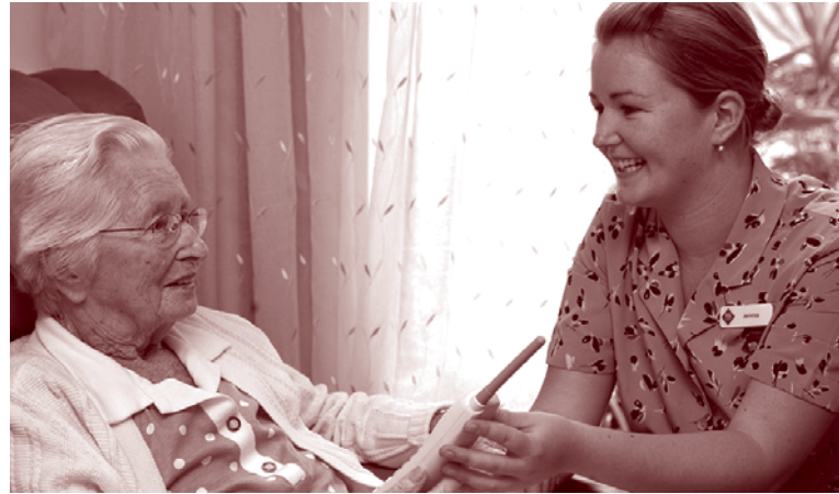
RSL Care staff member and resident at Alexandra Headland

continue to live in affordable accommodation within their local area.