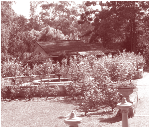
The Lakes of Cherrybrook

At Rowland Village, 13 new cottages have been completed; nearby, the acquisition of management rights for the Lakes of Cherrybrook has been finalised. At Linton Village, Yass, work is about to start on 32 extra residential care beds and another 17 retirement village units.