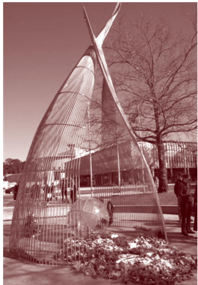
ACT War Memorial

The well attended and supported Dedication and Inaugural Memorial Service of the Memorial was held on Thursday 10 August. The Memorial consists of two parts, the physical sculpture in Ainslie Avenue and the records of the people being honoured, which can be accessed through www.memorial.act.gov.au .